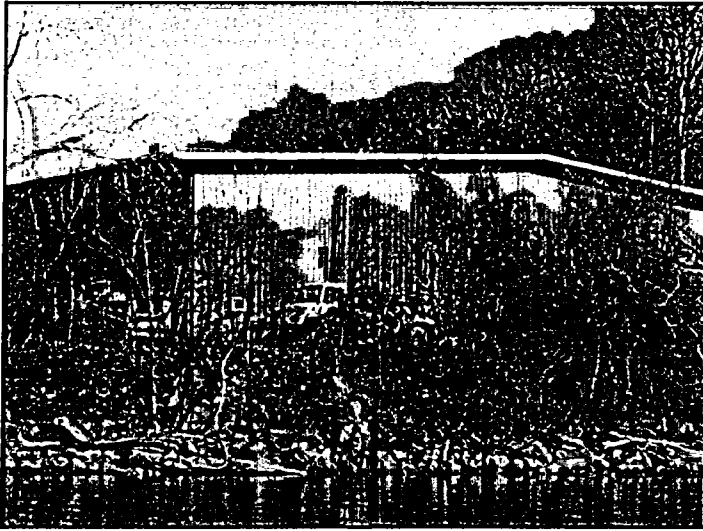
Picture above shows the location of Monitoring Well 48 during well construction.