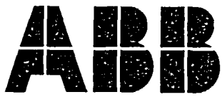
ABB Combustion Engineering Nuclear Fuel Combustion Engineering, Inc. Post Office Box 107 3300 State Road P Hematite, MO 63047