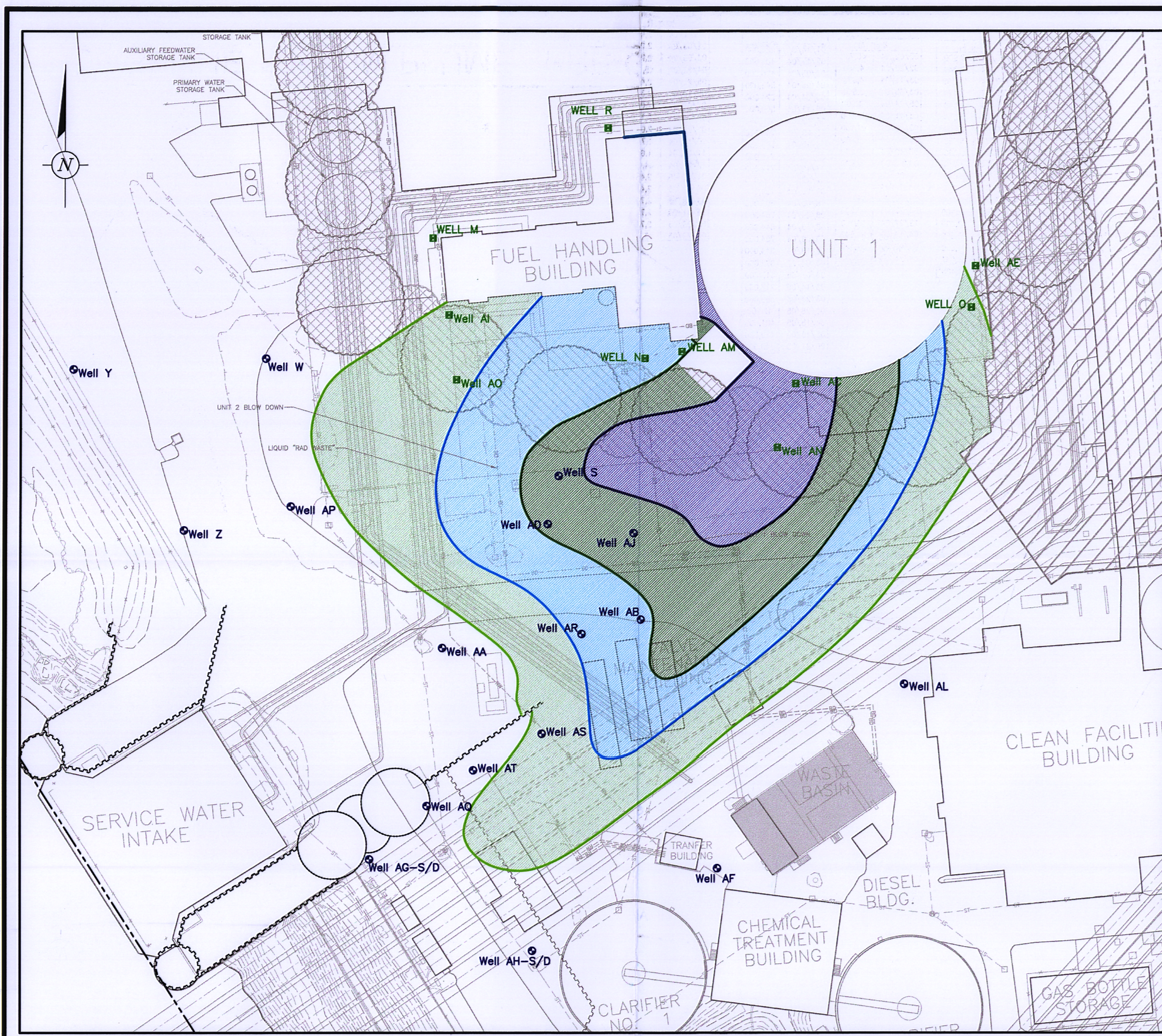
BASELINE TRITIUM PLUME - PRE-GROUNDWATER EXTRACTION SCALE: 1"=40'