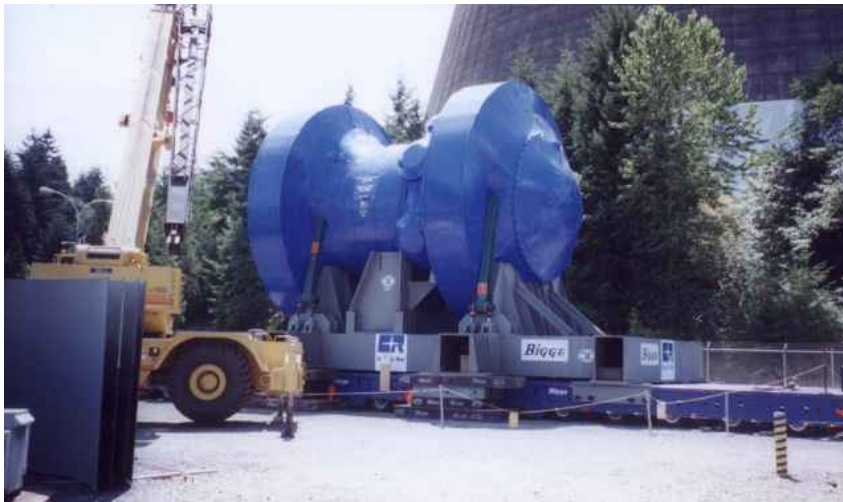
Trojan's reactor vessel being transported during decommissioning.