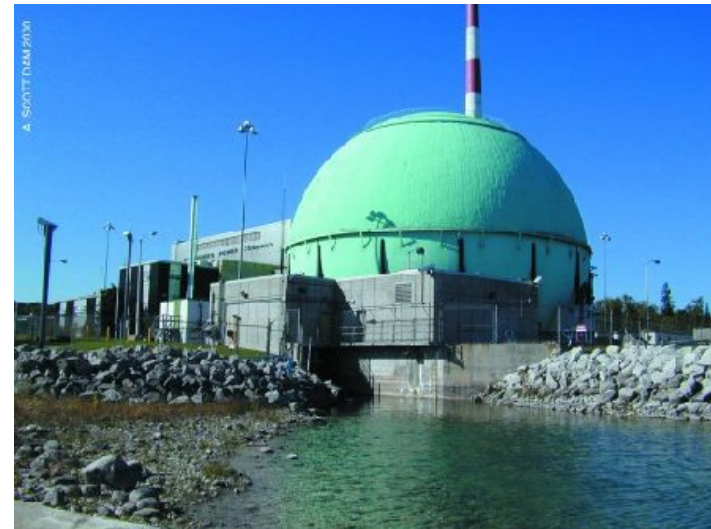
Big Rock Point.