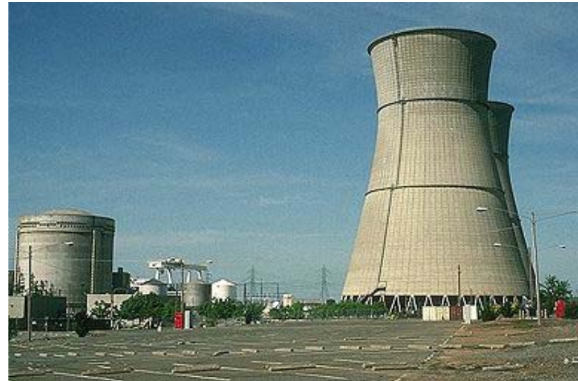
Rancho Seco, in Herald, California, operated between 1974 and 1989.