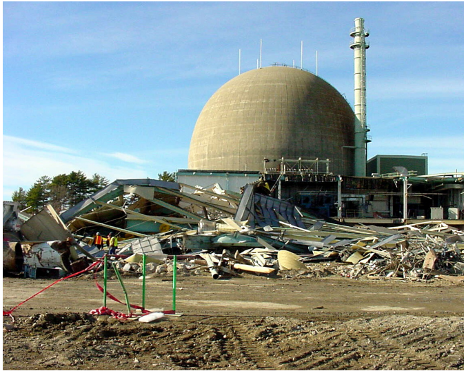
Maine Yankee undergoing decommissioning.