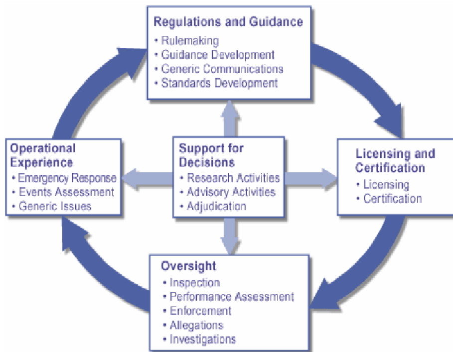
Figure 2. Overview of US regulatory and oversight process (from [17]).

A preliminary comparison of the periodic safety review process and NRC's regulatory and oversight process indicates many similarities [17,18]. PSRs are comprehensive assessments to: (i) determine, at the time of the review, whether the plant complies with its licensing basis; (ii) identify the extent to which the current licensing basis remains valid, in-part, by determining the extent to which the plant meets current safety standards and practices; (iii) provide a basis for implementing appropriate safety improvements, corrective actions, or process improvements; and (iv) provide confidence that the plant can continue to be operated safely. These PSR objectives are substantively accomplished in the United States on an ongoing basis [18]. NRC's regulatory process provides a robust foundation for ongoing assessments, evaluations, and when appropriate, imposition of new requirements. NRC and the U.S. nuclear industry have a 30-year history of implementing broad-based plant assessments. As shown in Fig. 2, the US regulatory and oversight process is based upon a cycle of operational experience, regulations & guidance, licensing & certification, and oversight with advisory adjudication, research, and advisory activities as the hub [17].