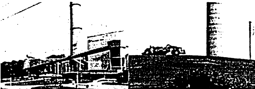
Views of the Tennessee Valley Authority's Bull Run and Kingston Steam Plants. These coal-fired facilities generate electricity for Oak Ridge and the surrounding area.

An average value for the thermal energy of coal is approximately 6150 kilowatt-hours(kWh)/ton. Thus, the expected cumulative thermal energy release from U.S. coal combustion over this period totals about 6.87 \times 10^{14} kilowatt-hours. The thermal energy released in nuclear fission produces about 2 \times 10^9 kWh/ton. Consequently, the thermal energy from fission of uranium-235 released in coal combustion amounts to 2.1 \times 10^{12} kWh. If uranium-238 is bred to plutonium-239, using these data and assuming a "use factor" of 10%, the thermal energy from fission of this isotope alone constitutes about 2.9 \times 10^{14} kWh, or about half the anticipated energy of all the utility coal burned in this country through the year 2040. If the thorium-232 is bred to uranium-233 and fissioned with a similar "use factor", the thermal energy capacity of this isotope is approximately 7.2 \times 10^{14} kWh, or 105% of the thermal energy released from U.S. coal combustion for a century. Assuming 10% usage, the total of the thermal energy capacities from each of these three fissionable isotopes is about 10.1 \times 10^{14} kWh, 1.5 times more than the total from coal. World combustion of coal has the same ratio, similarly indicating that coal combustion wastes more energy than it produces.