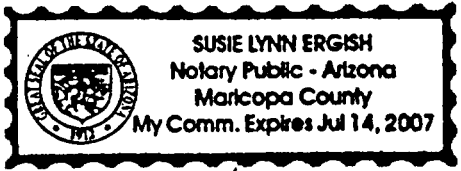
Notary Commission Stamp

ENCLOSURE(S) CONTAIN(S) SAFEGUARDS INFORMATION UPON SEPARATION THIS PAGE IS DECONTROLLED