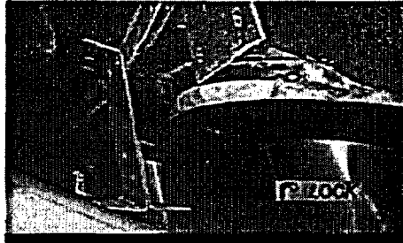
Figure 2: Picture showing Horizontal RMI Support Leg

It can be concluded that a hardship or unusual difficulty without a compensating increase in level of quality or safety would result if physical modifications were performed to achieve the complete coverage of the RPV head base material required by the First Revised Order. These modifications would include coil stack disassembly, to accommodate lifting of the shroud ring, and removal of the horizontal RMI panels to permit examination.