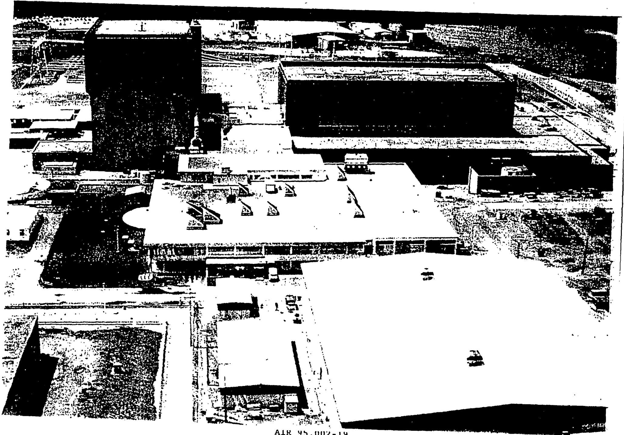
AIR 95.002-19 JULY 21, 1995 EAST SIDE OF JAF PLANT HYPA JAF PHOTO LAB