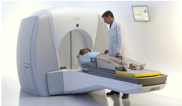
Gamma Knife®

About one-third of all patients admitted to hospitals are diagnosed or treated using radiation or radioactive materials. This branch of medicine is called nuclear medicine. The radioactive materials used are called radiopharmaceuticals.