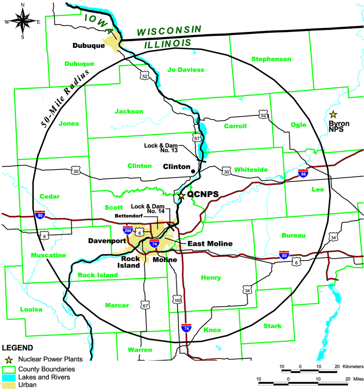
Figure 1. Quad Cities Nuclear Power Station 80-km (50-mi) Region