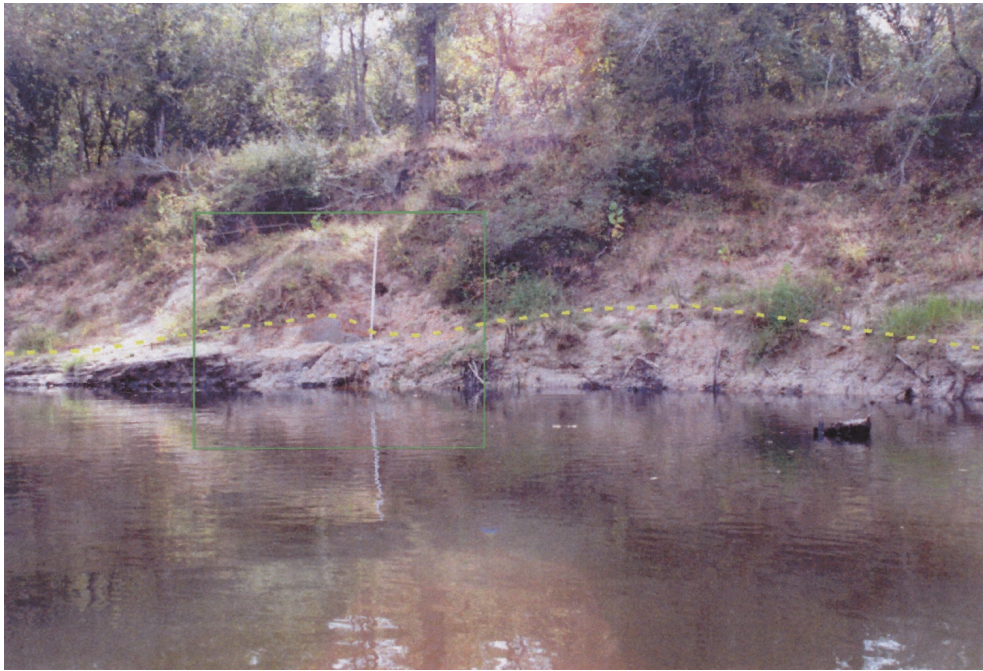
A) Subtle anticline (shown by yellow dashed line) exposed in banks of Saline River. Deweyville terrace surface approximately 20 feet above the river is in the background.