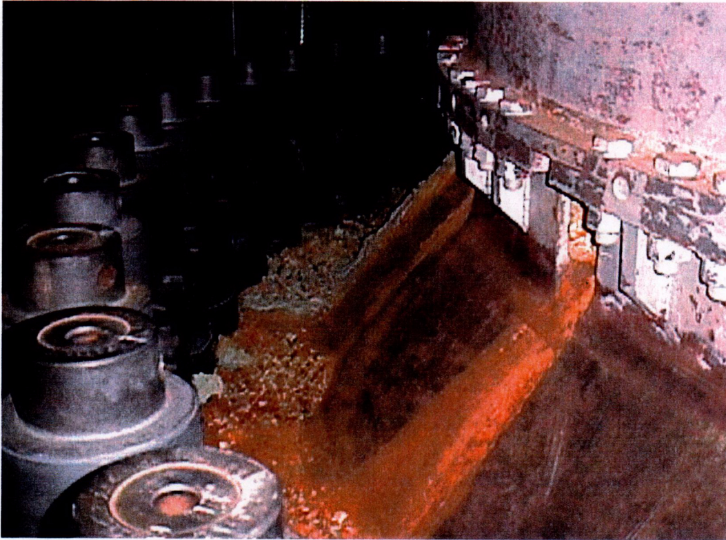
On east side facing south