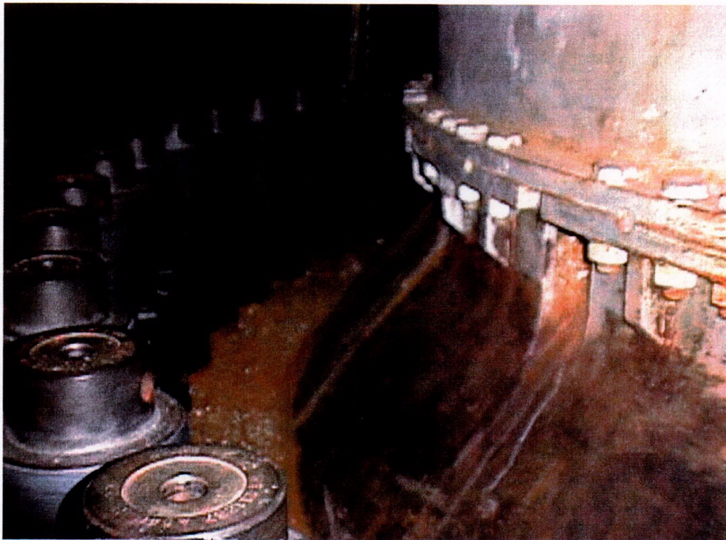
On north side facing east