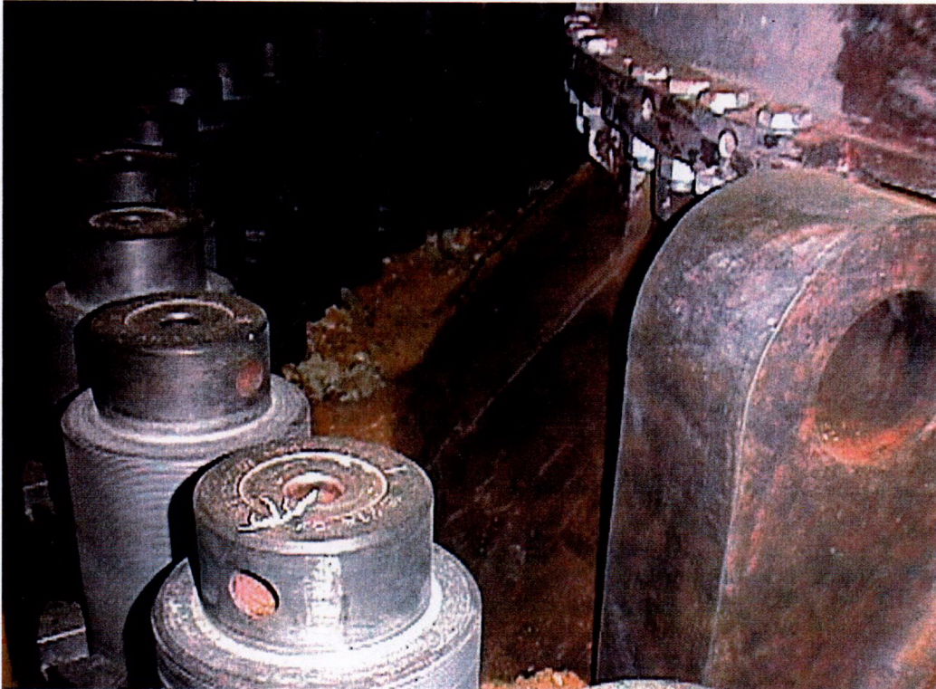
On north side facing south east