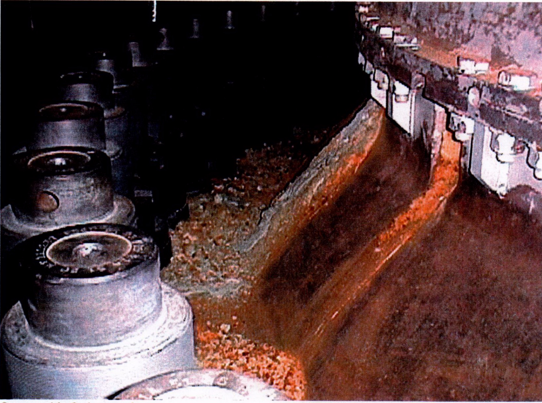
On east side facing south