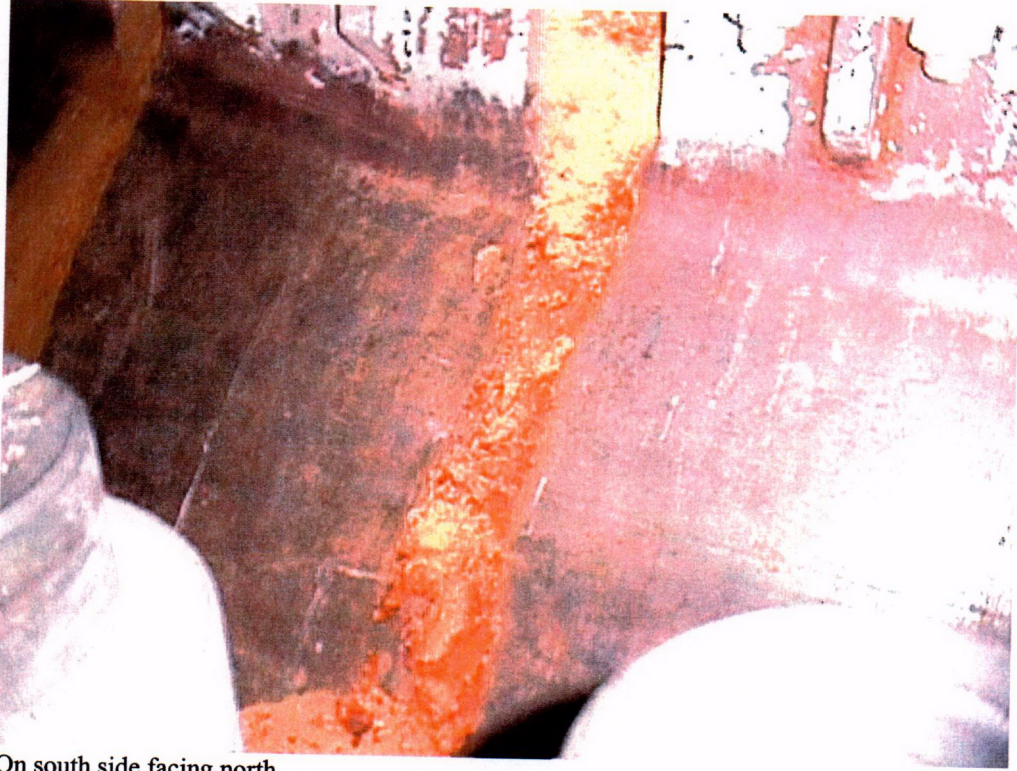
On south side facing north