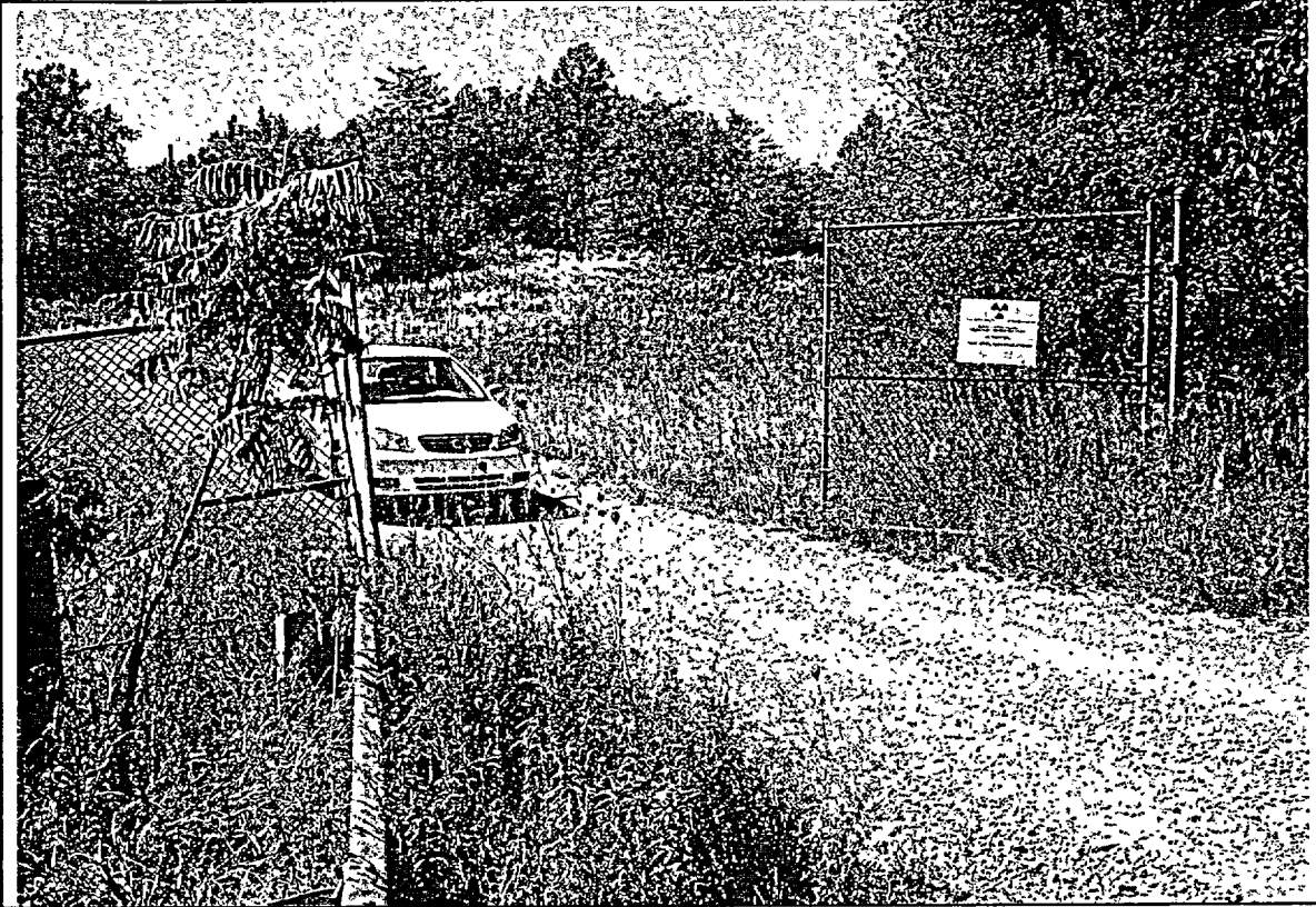
9/2002. Photo 2. West gatepost of access gate at Strangford Road, Burrell, Pennsylvania, disposal site.