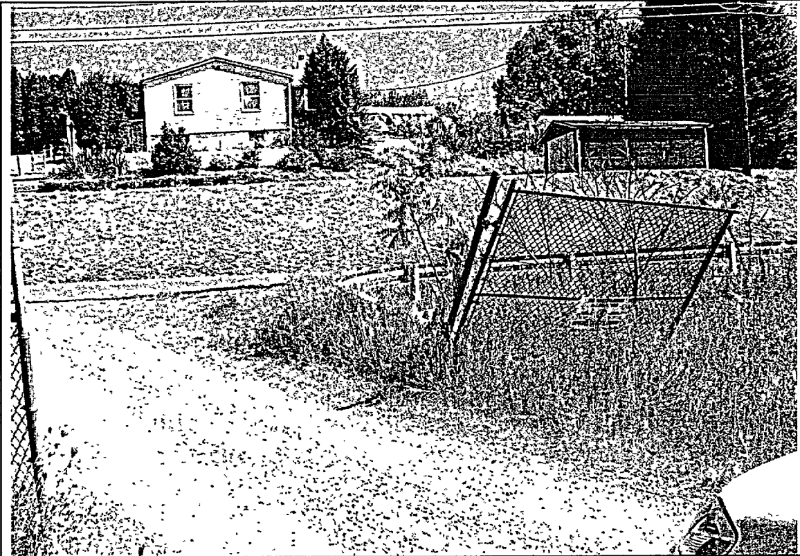
9/2002. Photo 1. East gatepost of access gate at Strangford Road, Burrell, Pennsylvania, disposal site.