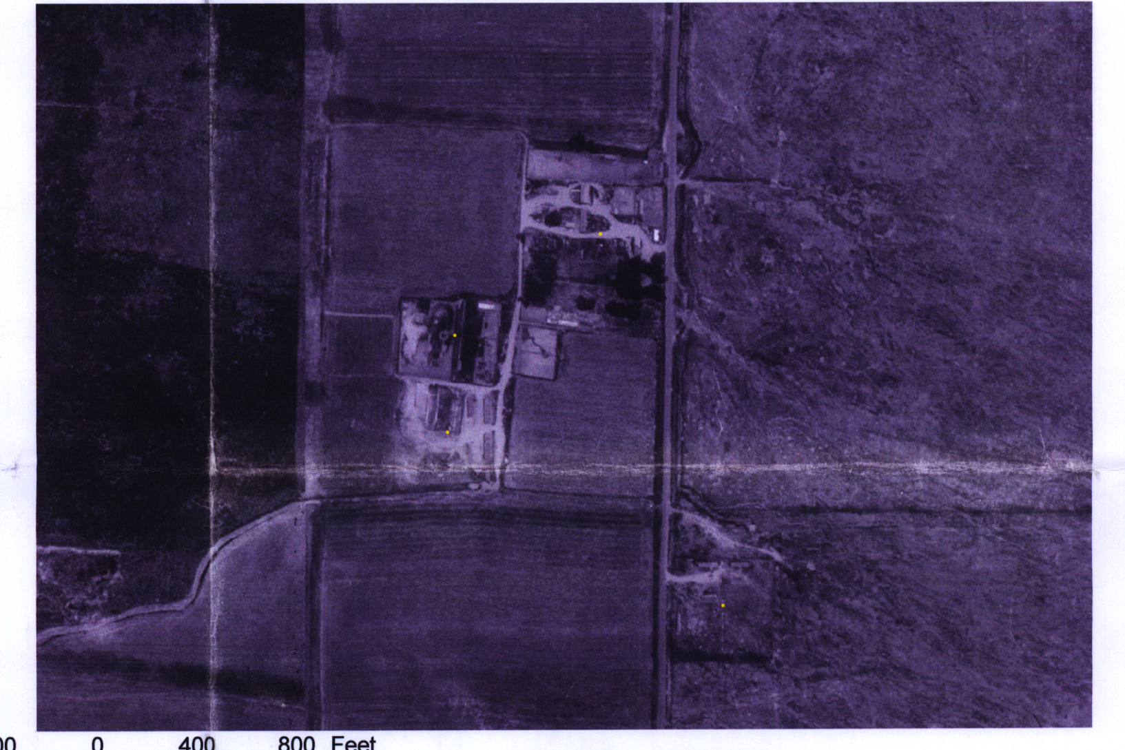
400 0 400 800 Feet Inset B (Ranch/Residence)