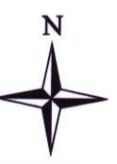
PHOTO DATE: 2002 COORDINATES: NAD 83 FEET OKLAHOMA NORTH