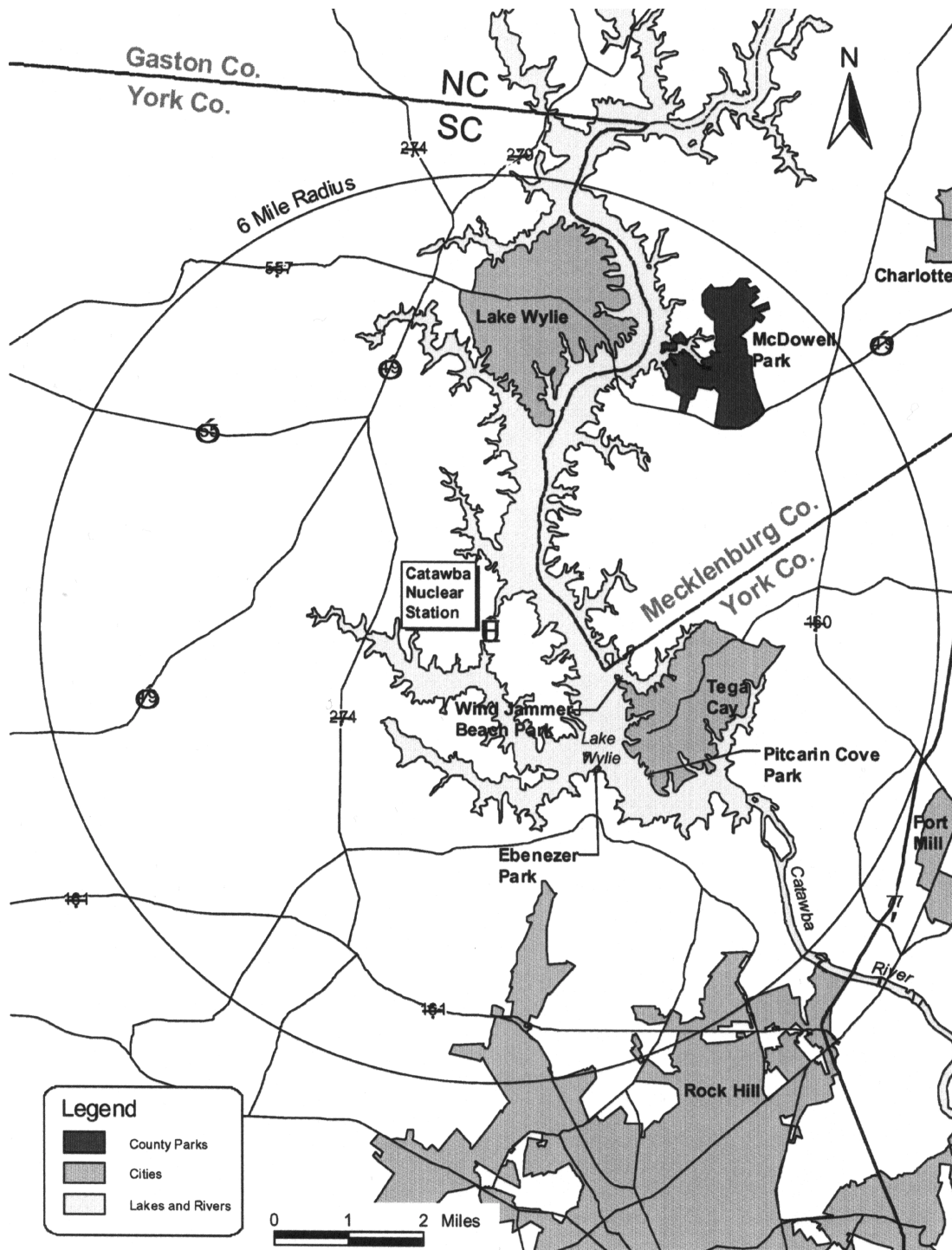
Figure 2-2. Location of Catawba 10-km (6-mi) Region (Duke 2001a)