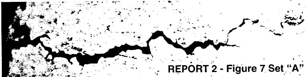
REPORT 2 - Figure 7 Set "A"