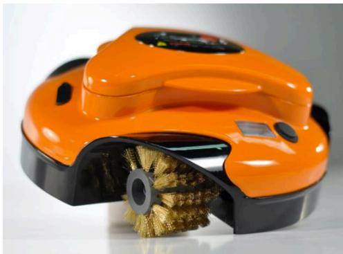
Consumer – Grill cleaner