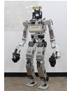
Hubo : DARPA Winner - 2015