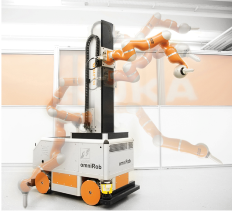
Aerospace - Sealant Applicator