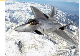
F22 RAPTOR – 2010s