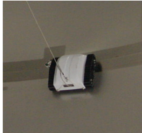
Agriculture – Silo Inspection