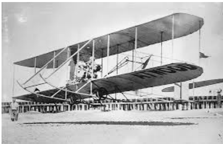
Wright Brothers - 1903