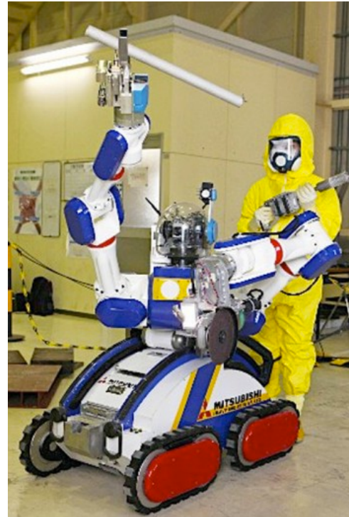
MEISTER – dual armed system for light duty tasks such as carrying, drilling, opening/closing valves