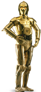
C-3PO (Fiction) - 1977