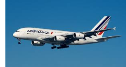
Airbus A380 – 2010s