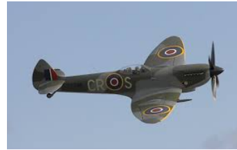
Spitfire – 1940s