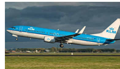
Boeing 737 – 1970s