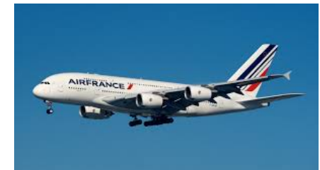
Airbus A380 – 2010s