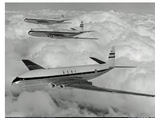
De Havilland Comet – 1950s