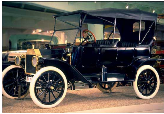
Model T - 1908