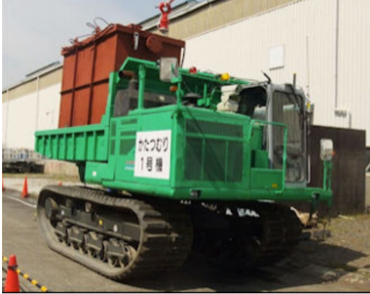
Robo crawl and dump – fixing contamination