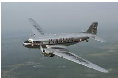
Douglas DC3 - 1936