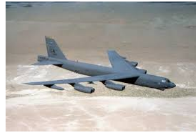
B52 Bomber – 1950s