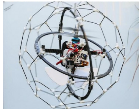
Oil & Gas – Surveillance drone