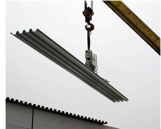
Construction – Panel Handler