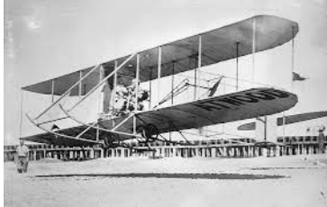
Wright Brothers - 1903