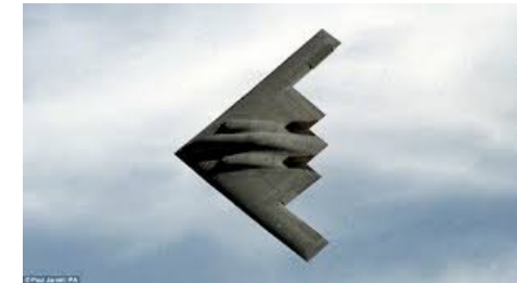
B2 Stealth Bomber – 1990s