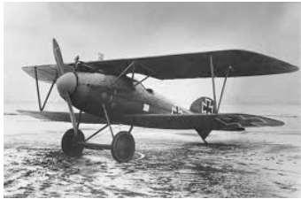
WWI fighter plane – 1918