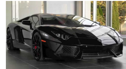
Lamborghini Aventador - 2015