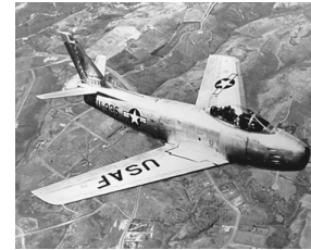
P86 Fighter – 1950s