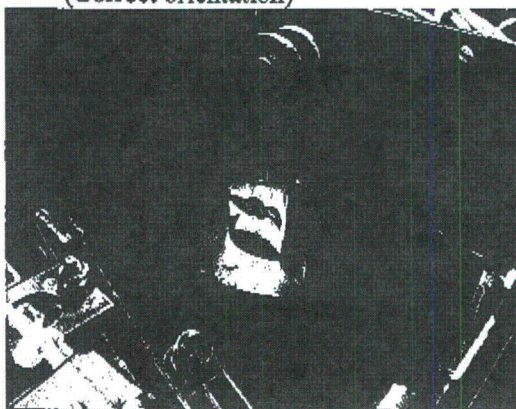
Correct orientation with the marked spring assembly on the left side of the mechanism.