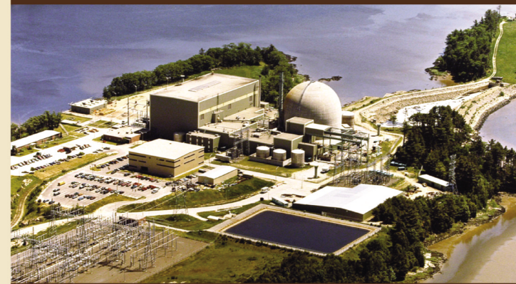
After (Land View)