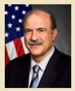
Commissioner George Apostolakis