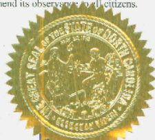
BEVERLY EAVES PERDUE

NOW, THEREFORE, I, BEVERLY EAVES PERDUE, Governor of the State of North Carolina do hereby proclaim November 2011, as "RADIATION SAFETY MONTH" in North Carolina and commend its observance to the citizens.