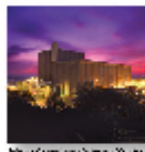
North Carolina State University

The policy statement applies to all licenses issued under 15A NCAC 11 .0300, all registrations issued under 15A NCAC 11 .0200, all mammography facilities, and all applicants for a license or a registration subject to NCRPS authority. While the safety culture policy statement and traits are not incorporated into the regulations, many of the traits may be inherent to existing radiation safety programs.