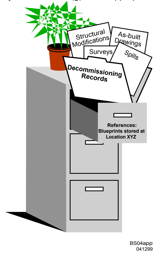
Figure 8.1 Types of Records that Must be Maintained for Decommissioning

Furthermore, pursuant to 10 CFR 30.51(f), prior to license termination, each licensee shall forward the records required by 10 CFR 30.35(g) to the appropriate regional office.