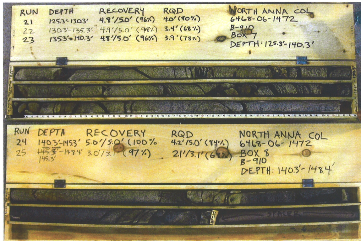
B-910 - Box 7