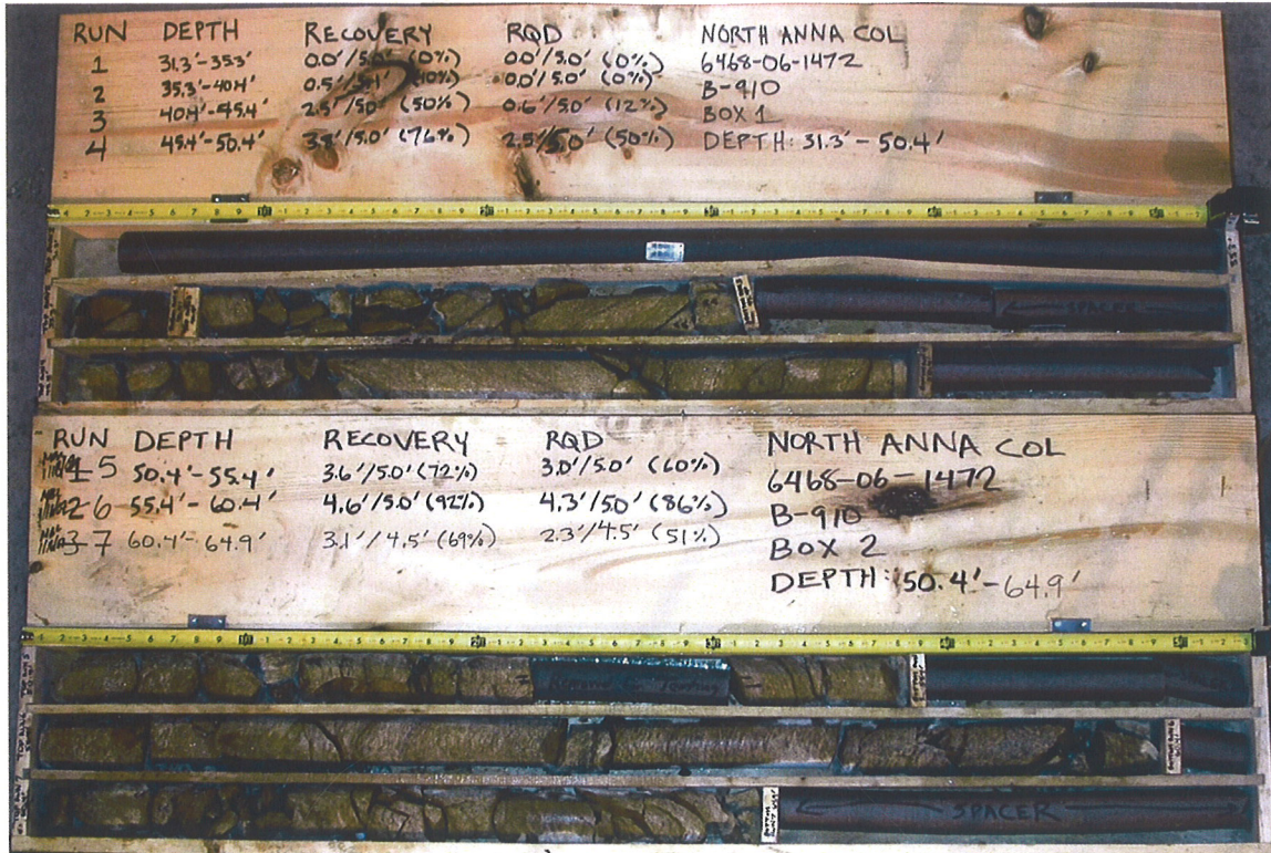
B-910 - Box 1