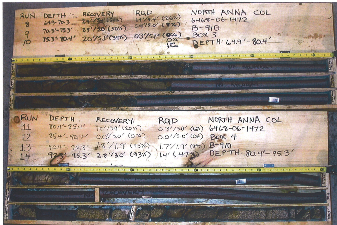
B-910 - Box 3