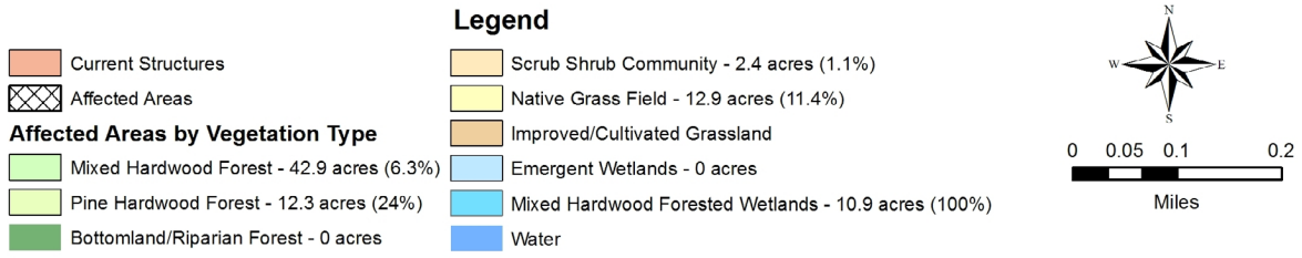
FIGURE 4.3-1 Habitat Affected by Construction