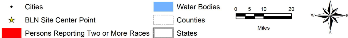
FIGURE 2.5-24 Persons Reporting Two or More Races, Three-State Geographic Area