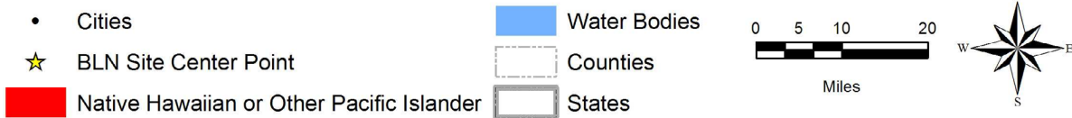
FIGURE 2.5-23 Native Hawaiian or Other Pacific Islander, Three-State Geographic Area