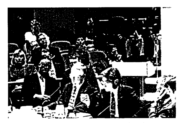
Whenever practicable, NRC will make a reasonable effort to provide teleconferencing access for meetings which are not easily accessible to interested citizens.

Whenever practicable, NRC will make a reasonable effort to provide teleconferencing access for meetings which are not easily accessible to interested citizens. Information about teleconferencing will be provided in individual meeting notices.