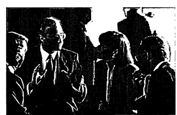
Category 2 meetings provide an opportunity for the public to provide NRC with feedback on the analysis of issues, alternatives, and/or decisions.

storage. These meetings provide an opportunity for the public to not only observe and obtain factual information, but to also participate by providing NRC with feedback on issues, alternatives, and/or decisions.