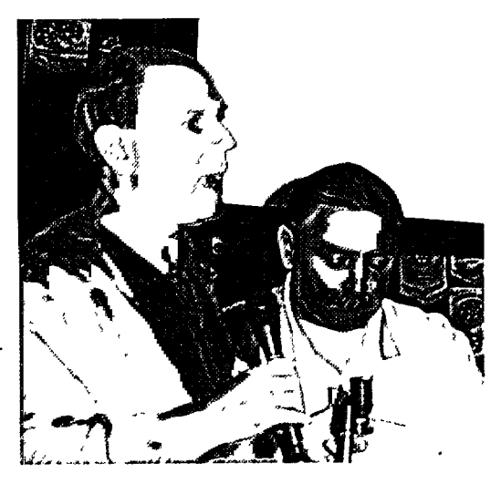
Category 1 meetings are typically held with one licensee and are open to public observation.

As a result of the September 11, 2001 terrorist attacks, attendees at NRC meetings will experience enhanced security procedures. Areas affected include NRC visitor registration, badging, sign-in proce-