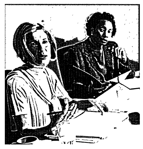
Category 3 meetings fully engage the public in discussions.

Meetings in this category are typically held with representatives of non-government organizations, private citizens or interested parties, or various businesses or industries to fully engage them in discussion. These types of meetings provide an opportunity for NRC and the public to work directly together to ensure that the issues and concerns are understood and considered by NRC. The intended objective for the public at this type